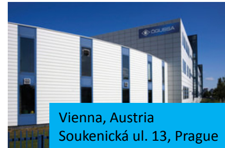
Vienna, Austria Soukenická ul. 13, Prague