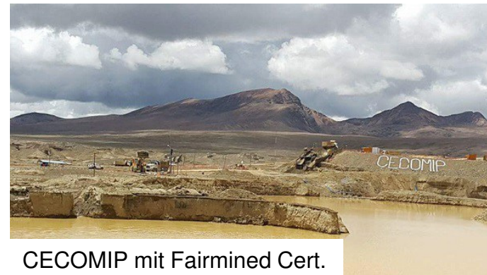
CECOMIP mit Fairmined Cert.