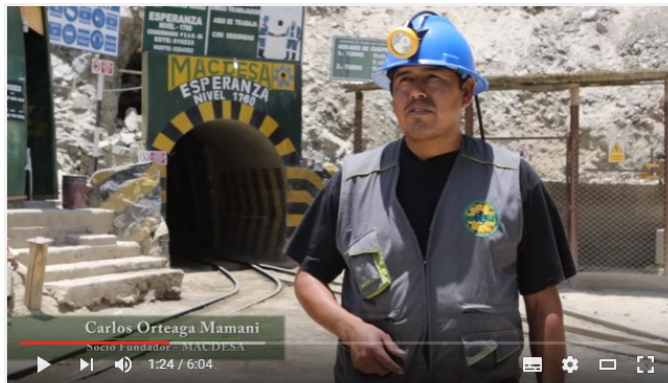
Ser Formal Vale Oro - MACDESA