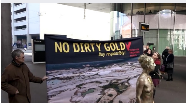
Basel World 2016